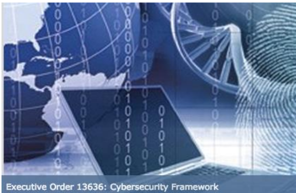
Executive Order 13636: Cybersecurity Framework

THE NORMAN GROUP MANAGEMENT CONSULTING offers unique expertise to each client for each engagement. Nowhere is that more important than in cybersecurity.