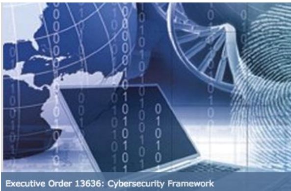
Executive Order 13636: Cybersecurity Framework

THE NORMAN GROUP MANAGEMENT CONSULTING offers unique expertise to each client for each engagement. Nowhere is that more important than in cybersecurity.